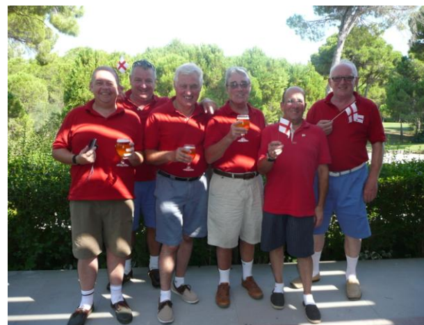
The teams following Anglo-Welsh match in Turkey