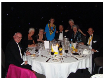
District Governor's Banquet