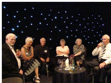
Black and White Ball