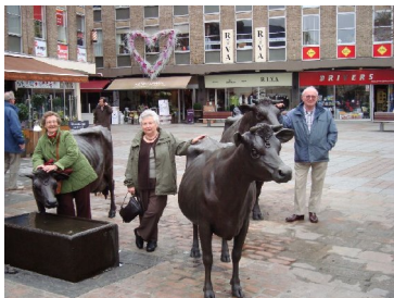
Meeting the locals