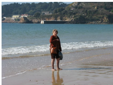
The President goes paddling